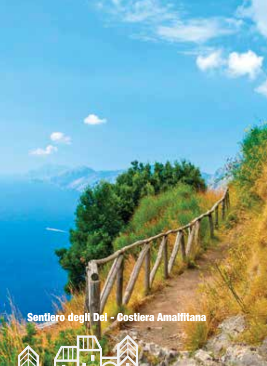
Sentiero degli Dei - Costiera Amalfitana