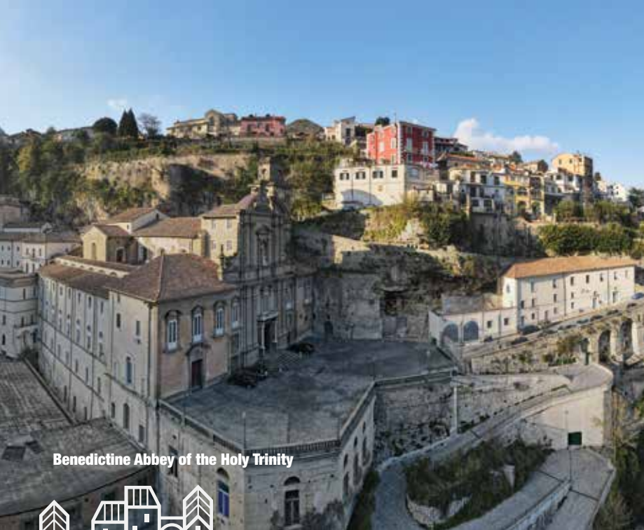
Benedictine Abbey of the Holy Trinity