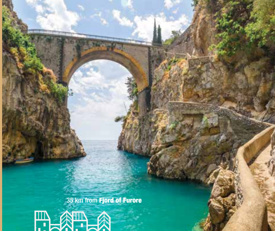
35 km from Fjord of Furore