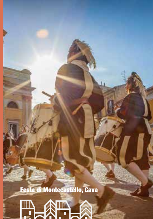
Festa di Montecastello, Cava