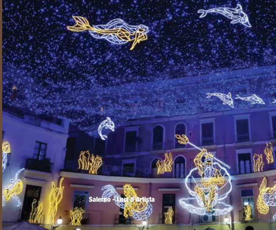
Salerno - Luci d'Artista