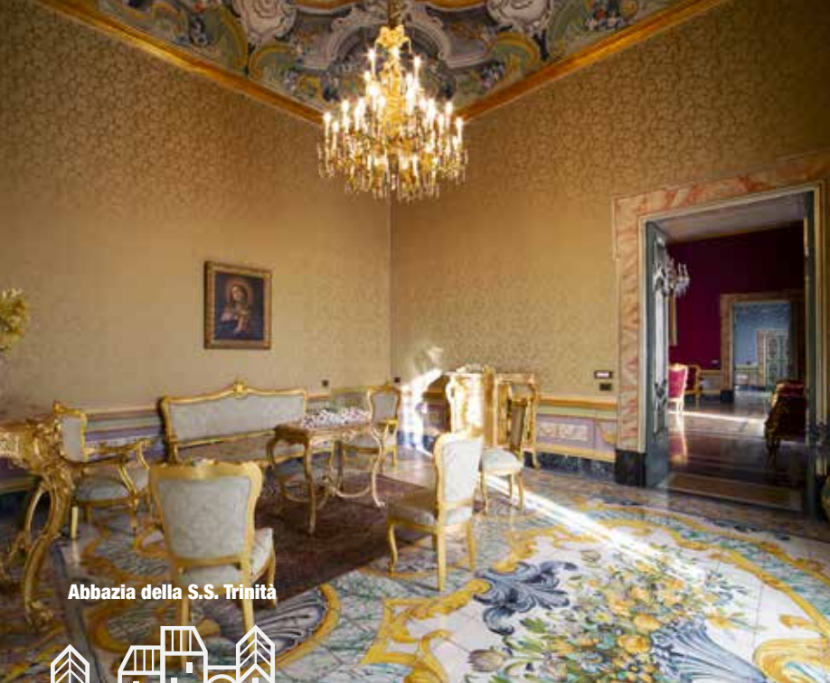
Abbazia della S.S. Trinità