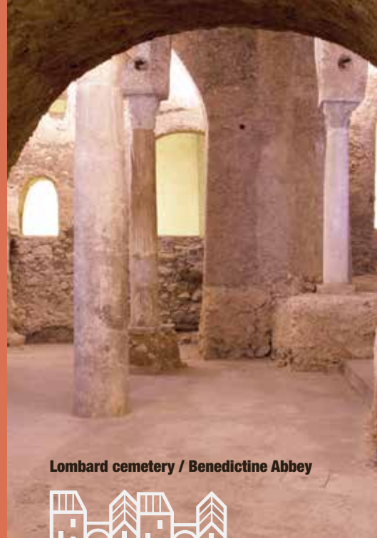
Lombard cemetery / Benedictine Abbey